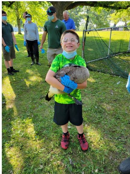
Kids having fun while learning