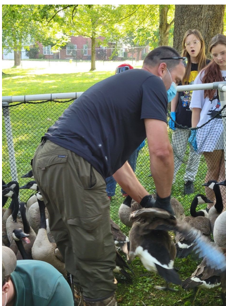
Pulling them out to be inspected and banded.