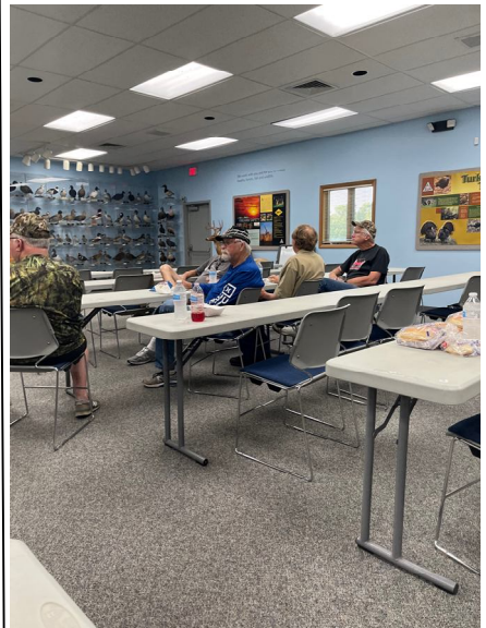
Safety briefing, eating grilled hotdogs and enjoying each others company.

were operating correctly and keeping them full of clay pigeons. All of these fine gentlemen were of the MDC staff assisting us. Could not of had such a great evening without you! Thanks!! Below are some pictures of that event: