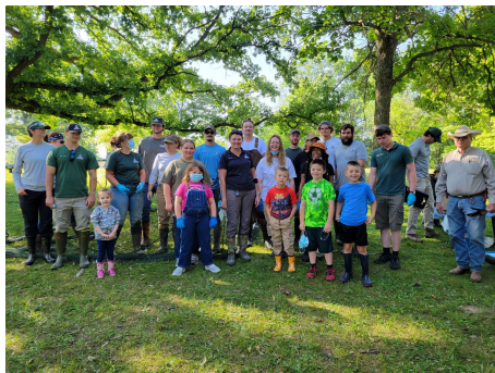
The volunteers and MDC staff.