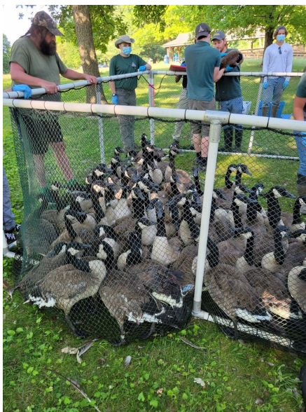
The round up.

The MDC goose banding was a huge success!!! Over 16 kids showed up and helped band over fifty geese! Huge thanks goes out to Erin Shank from MDC out of Powder Valley Nature Center for coordinating this! Below are some pictures of that event.