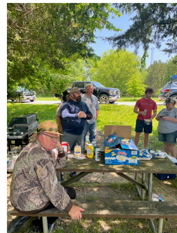
Enjoying the day.